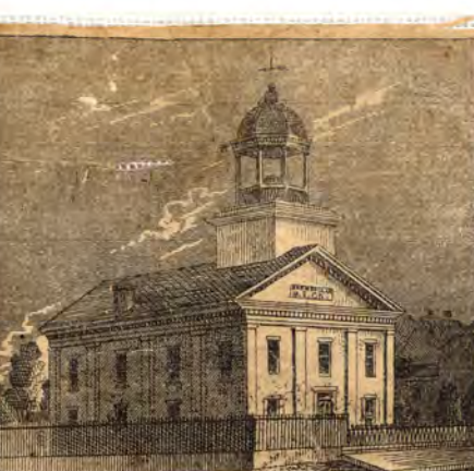
Church of M. E. Ch. Bloody Run.