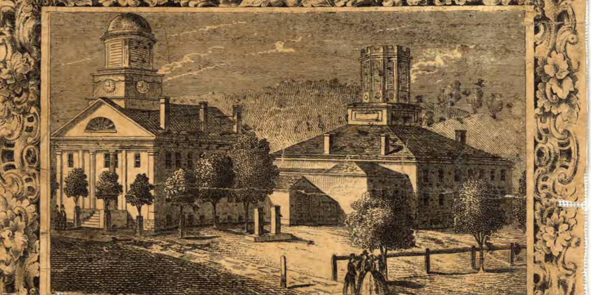
COURT HOUSE & JAIL, BEDFORD.