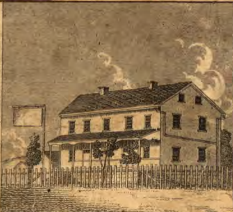
Res of Robt. Falsion Big Water St.