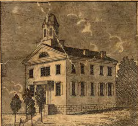
Alleghany Male & Female Seminary in Raleigh.