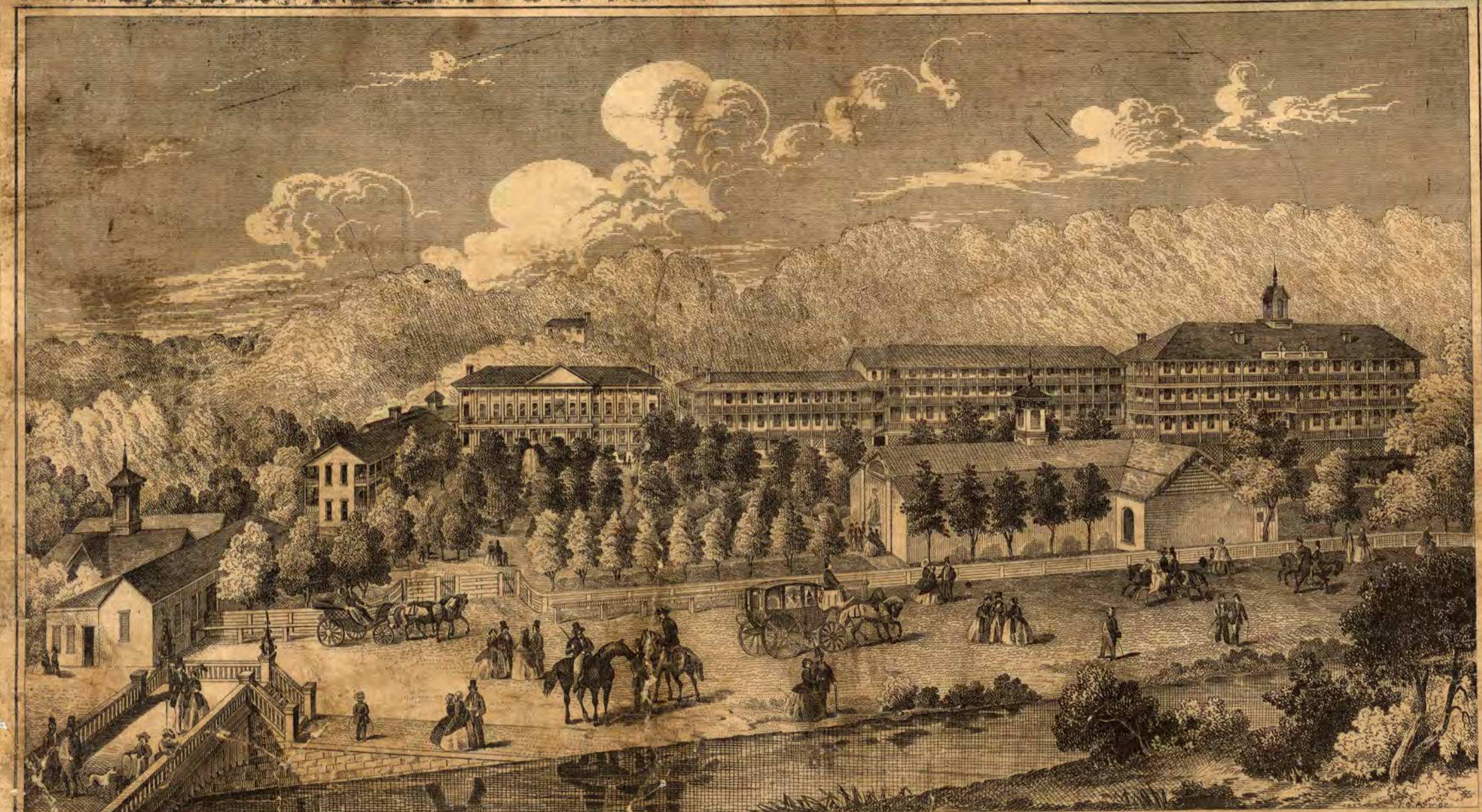
VIEW OF THE BEDFORD MINERAL SPRINGS.