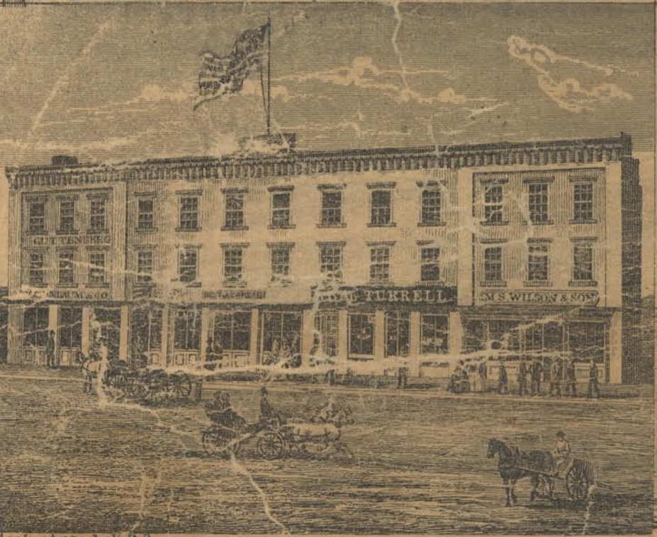
PHOENIX BLOCK MONTROSE