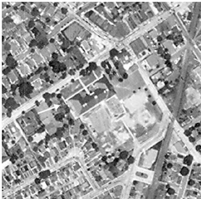
Aerial View of Garrettford Elementary School

1994 Lansdowne, PA Quadrangle . 7.5 minute series. Topography by planetable surveys 1939-1940. Revised from aerial photographs taken 1965. Field checked 1967. Revised 1994. Denver, CO or Reston, VA.