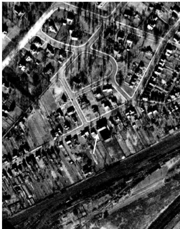
Aerial View of Sharpe Elementary School

1938 Aerial Photograph AHF 63-22. On file at the Pennsylvania State Archives, Record Group 31, Records of the Department of Commerce, State Planning Board Collection.