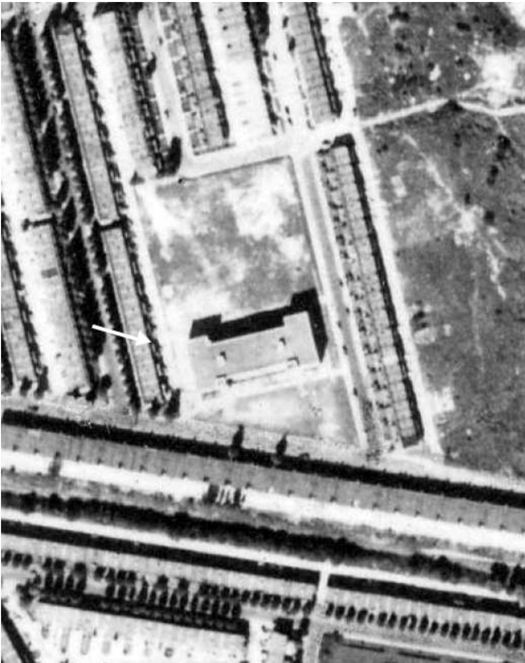
Aerial View of Stonehurst Hills Elementary School