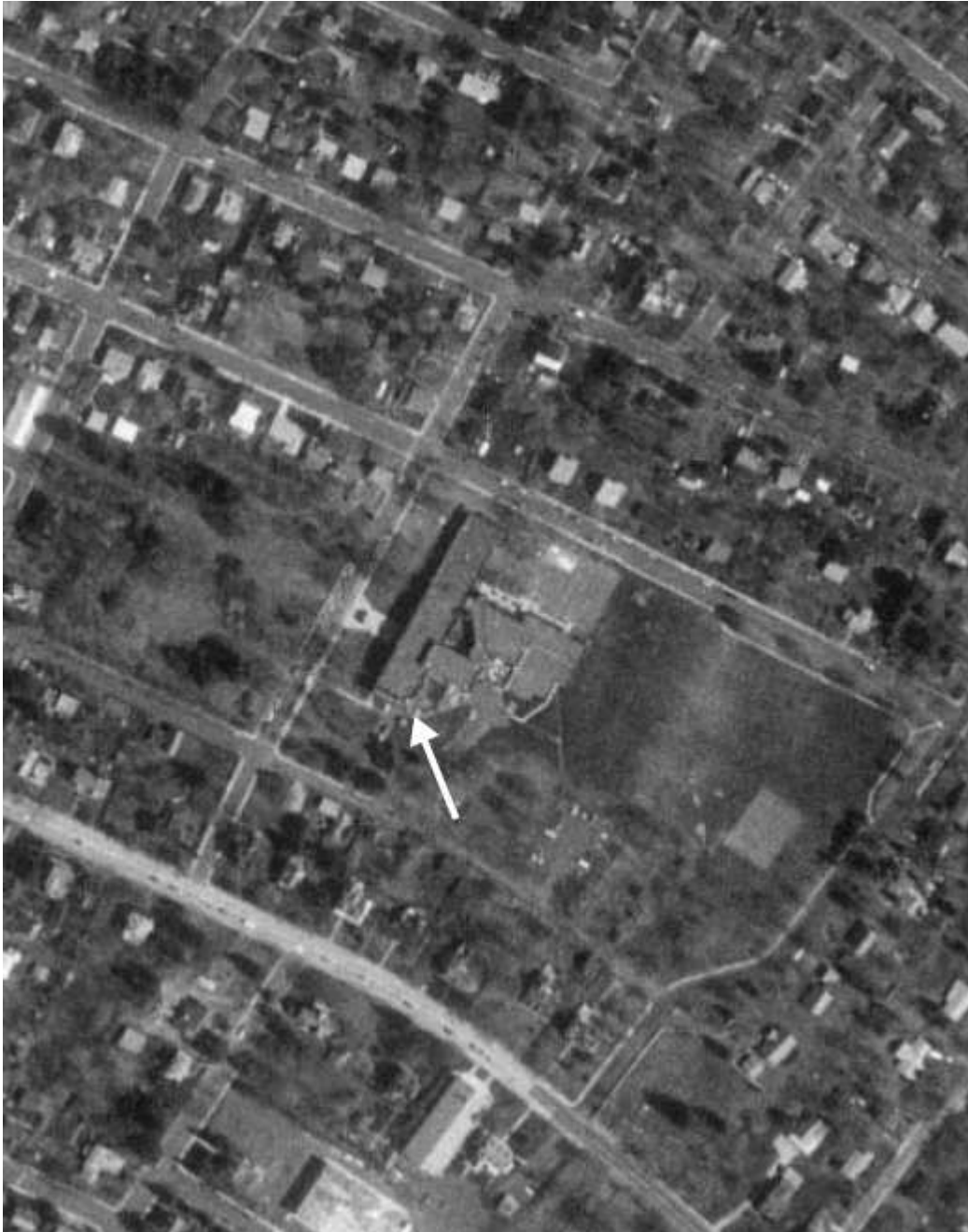
Aerial View of North Wales Elementary

1992 Lansdale NE, PA Aerial Photograph . USGS Reference Number 40075-B3-02-PHT. Created on April 14, 1992.