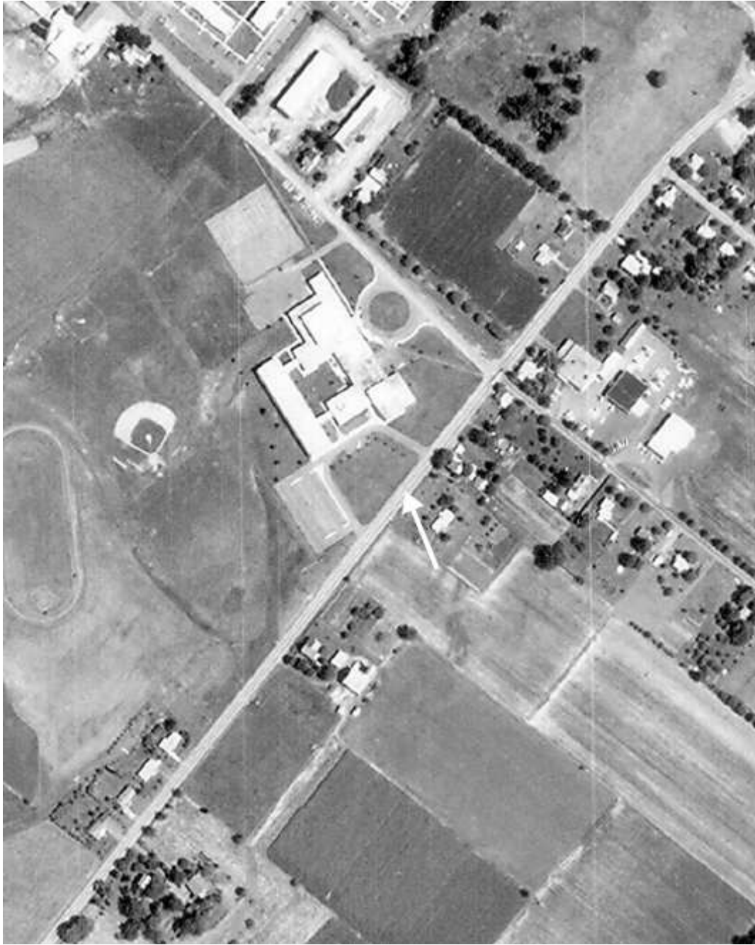
Aerial View of Pennsfield Middle School