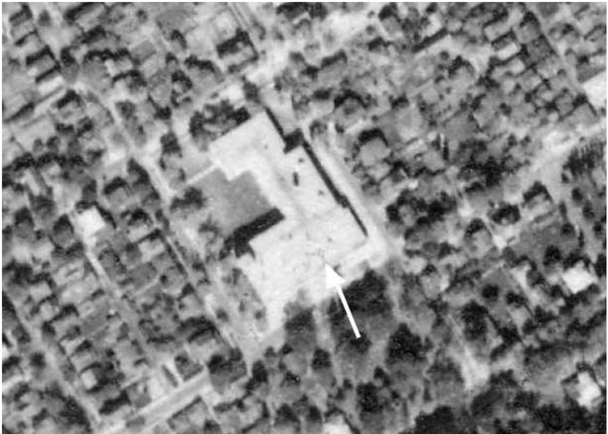
Aerial View of Philipsburg-Osceola Junior High