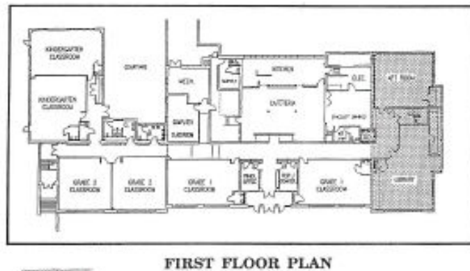
Floor Plan of Blue Mountain Cressona Elementary School