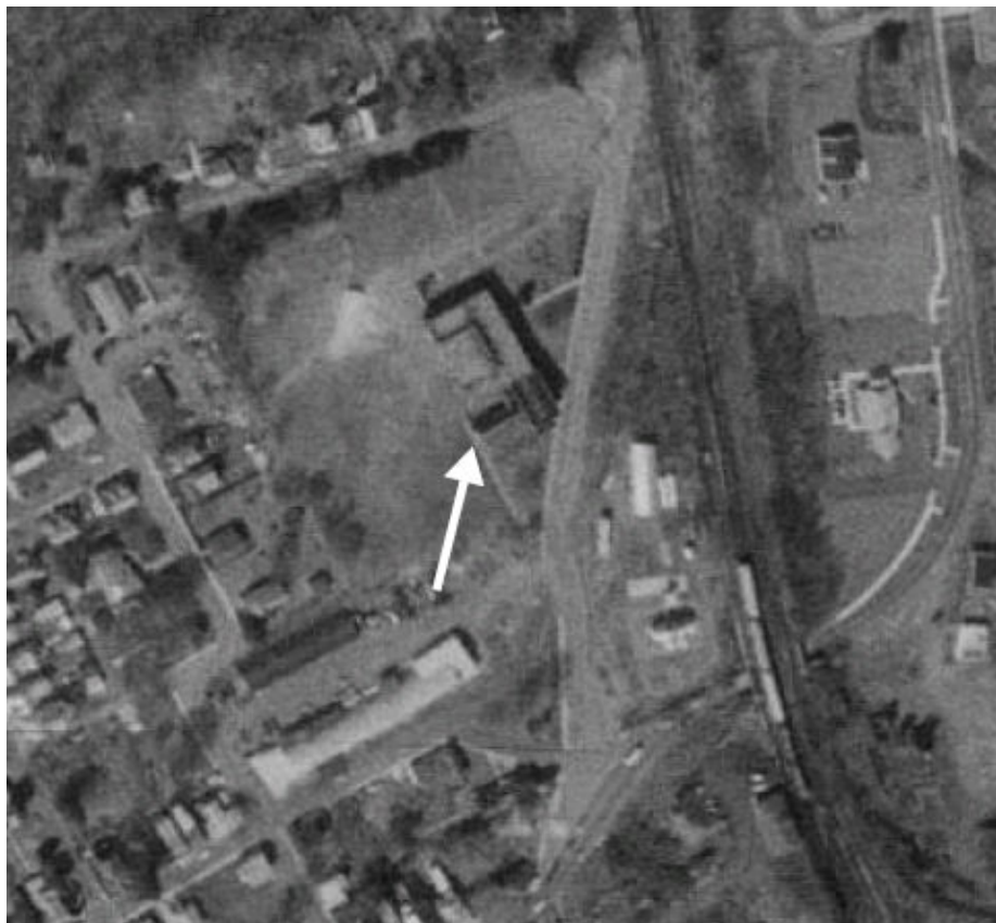
Aerial View of Blue Mountain Cressona Elementary School

1995 Pottsville, PA Quadrangle . Compiled by photogrammetric methods from imagery dated 1942. Field checked 1944. Revised from imagery dated 1992 and other sources. Field checked 1994. Map edited 1995. Denver, CO or Reston, VA.