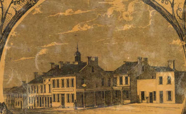
Exchange Hotel Blairsville