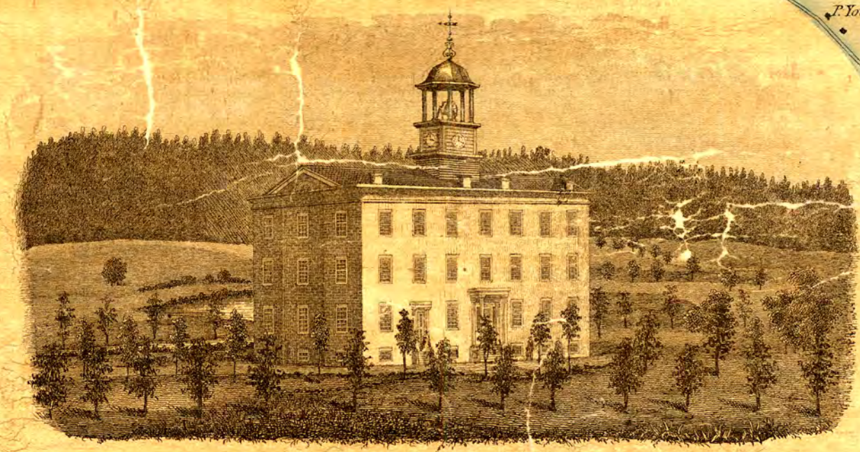
Union Seminary, New Berlin.