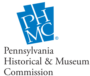
Configuration A: minimum height is 1.25 inches