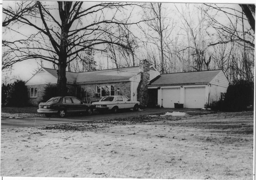
Photograph 3: South and east elevations of 3045 West Meadow View Drive, view looking west (January 2003).