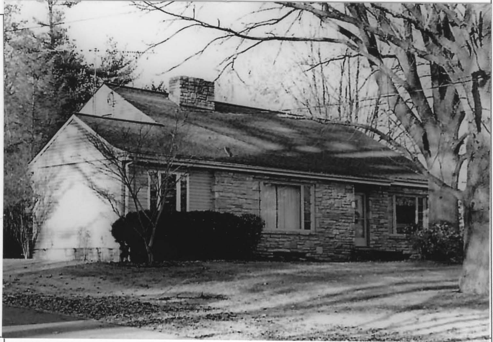
Photograph 4: South and west elevations of 3043 West Meadow View Drive, view looking north (January 2003).