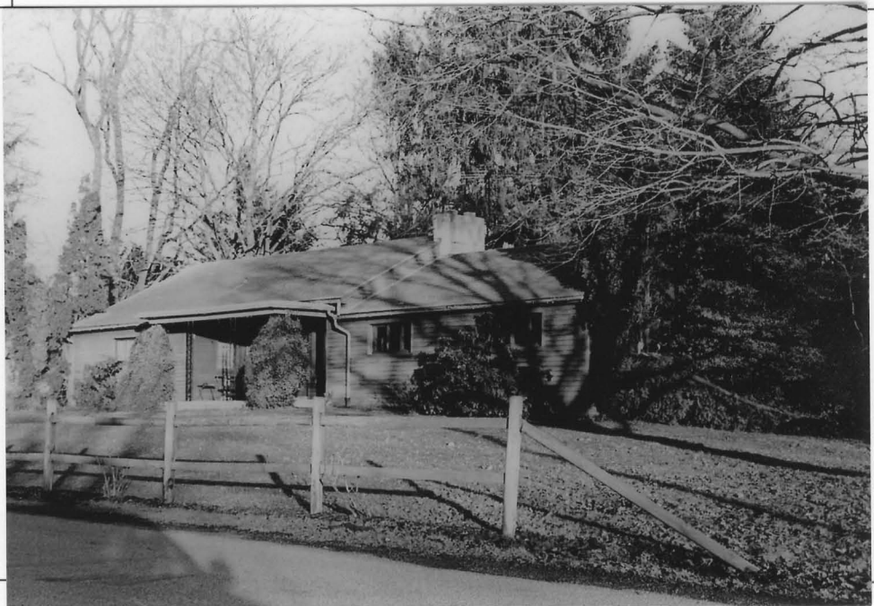
Photograph 5: West elevation of 11 Pequea Manor Drive, view looking northeast (January 2003).