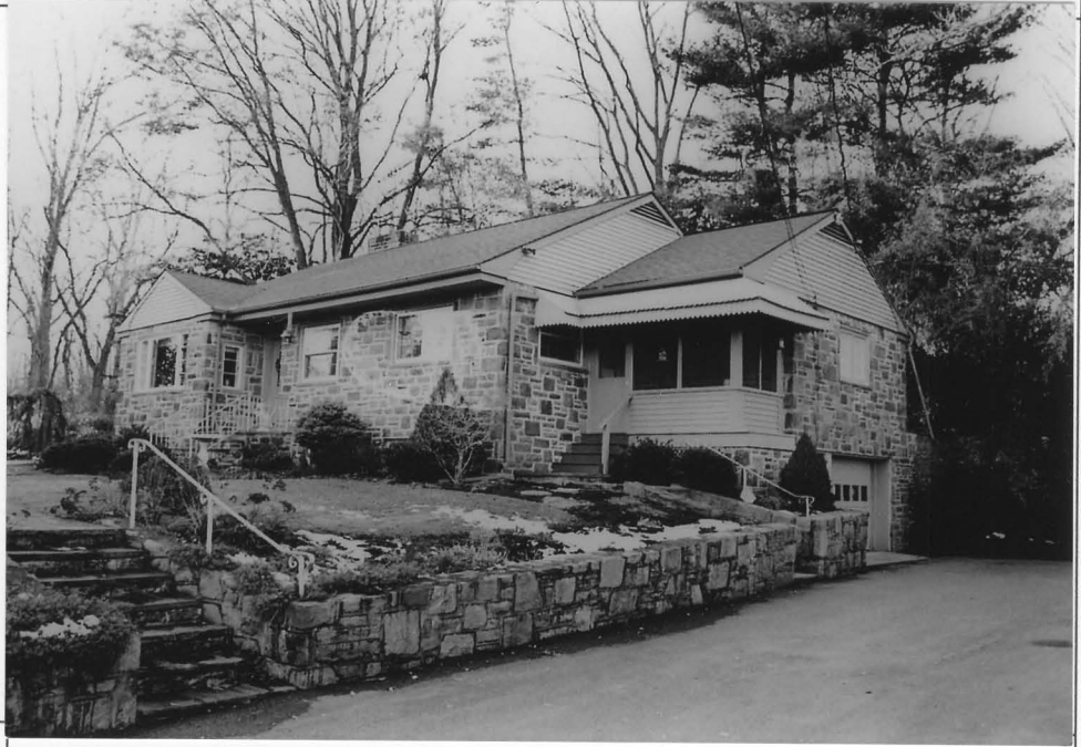
Photograph 2: South and east elevations of 36 Pequea Manor Drive, view looking west (January 2003).