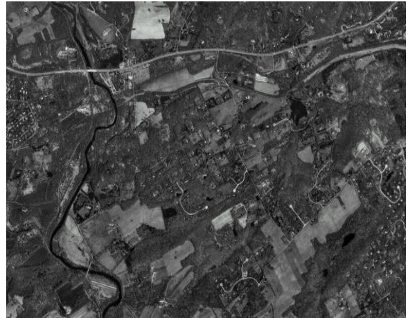
Chadds Ford, 1999