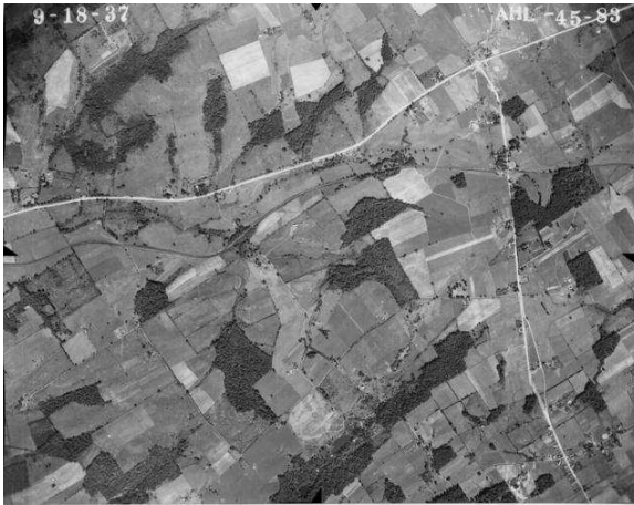
Chadds Ford, 1937