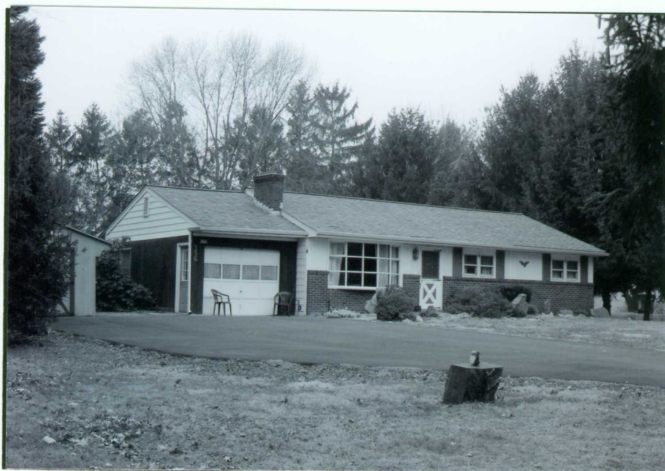
Photograph 5: Derstine Residential Grouping - This photograph is a representative example of a Ranch style dwelling. This dwelling is a common, unadorned example of its architectural type. View looking west (January 2006).