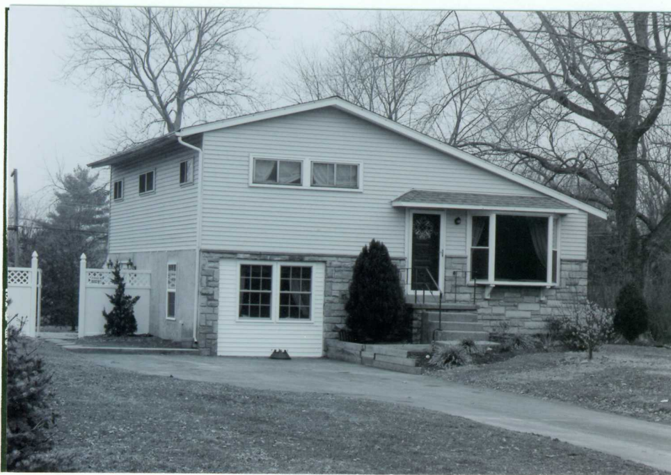
Photograph 4: Derstine Residential Grouping - This photograph is a representative example of a Split-level dwelling. This dwelling is a common example of its architectural type. Note the modern doors, windows, and cladding. View looking east (January 2006).