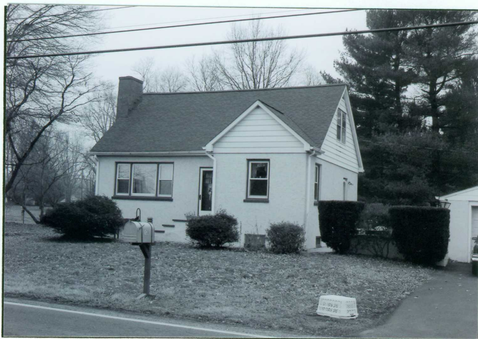
Photograph 3: Derstine Residential Grouping - This photograph is a representative example of a Minimal Traditional style dwelling. This dwelling is a common unadorned example of its architectural type. View looking south (January 2006).