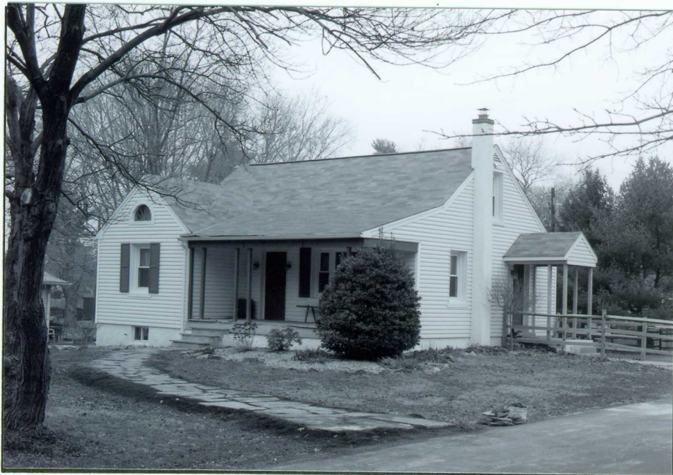
Photograph 11: Derstine Residential Grouping - This photograph is a representative example of a Minimal Traditional dwelling. Note the modern cladding, windows, doors, and additions. View looking north (January 2006).