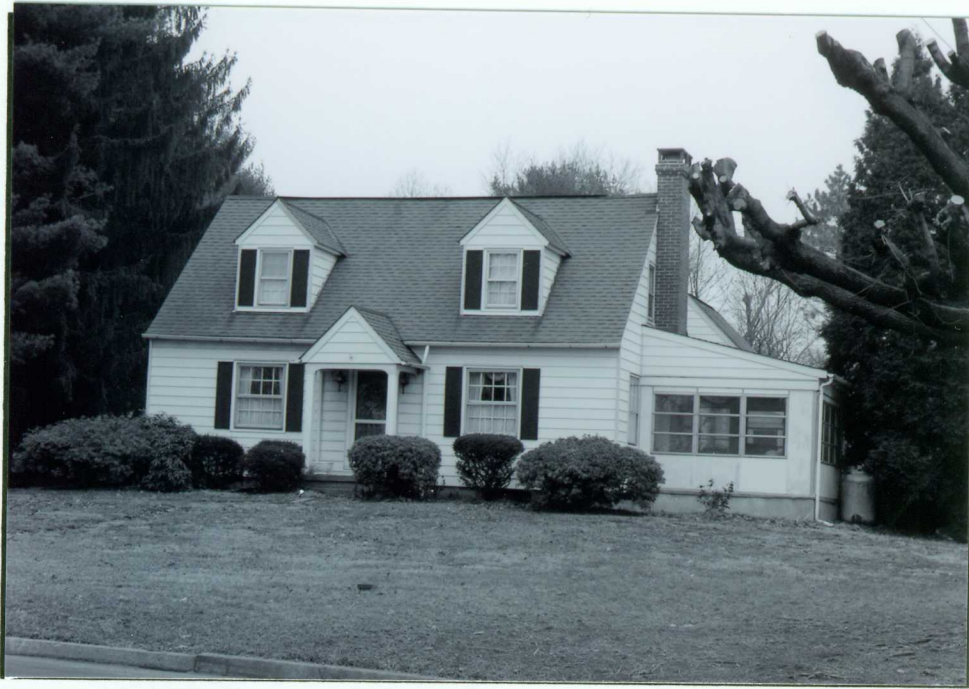
Photograph 8: Derstine Residential Grouping - This photograph is a representative example of a Colonial Revival dwelling. This dwelling is a common, unadorned example of its architectural type. Note the enclosed shed roof porch. View looking northeast (January 2006).