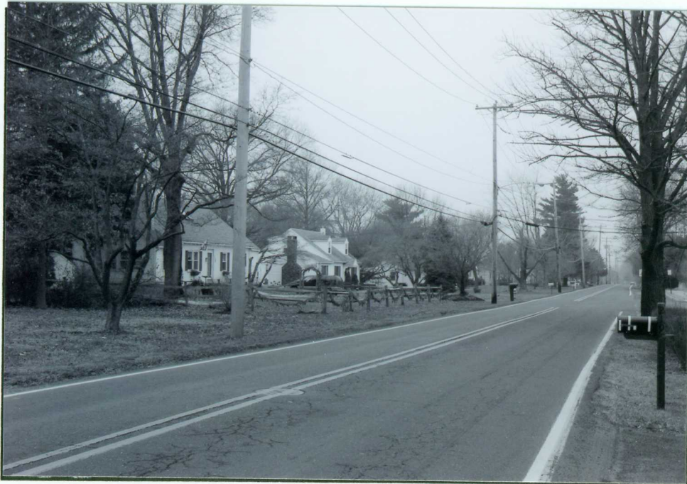
Photograph 2: Derstine Residential Grouping - This streetscape photograph is representative of the Derstine Residential Grouping. Note the lack of organized landscaping, sidewalks or other unifying features. View looking northwest along Bristol Road (January 2006).