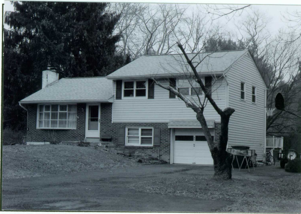
Photograph 6: Derstine Residential Grouping - This photograph is a representative example of a Split-level dwelling. This dwelling is a common, unadorned example of its architectural type. View looking northeast (January 2006).