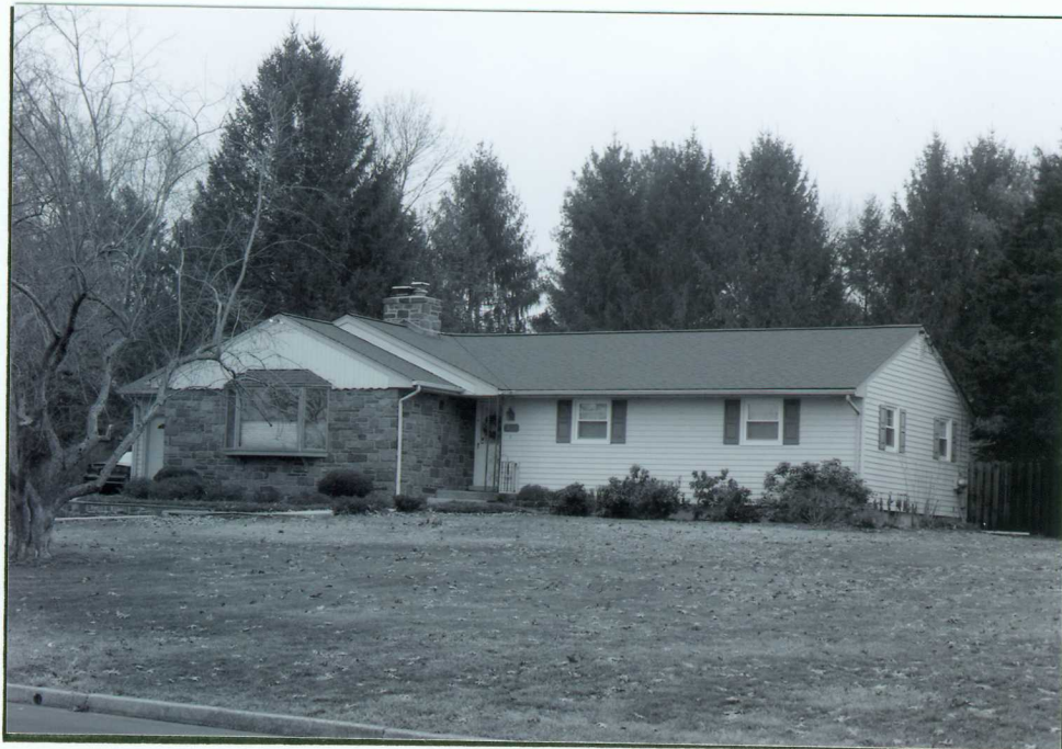
Photograph 9: Derstine Residential Grouping - This photograph is a representative example of a Ranch style dwelling. This dwelling is a common, unadorned example of its architectural type. The dwelling features modern cladding, doors, and windows. View looking north (January 2006).