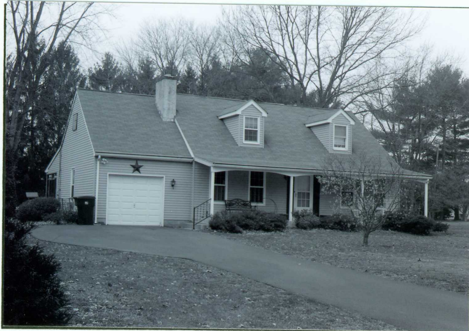
Photograph 7: Derstine Residential Grouping - This photograph is a representative example of a Colonial Revival dwelling. Note the modern doors, windows, and cladding. View looking west (January 2006).