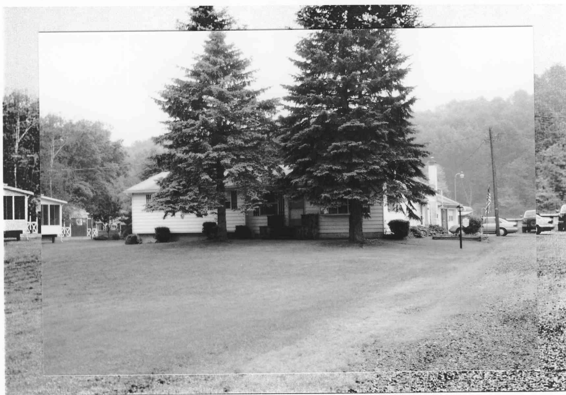
Photograph 7: 785 S.R. 0287. Dwelling, view of the east elevation looking west.