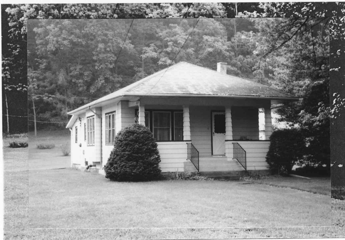
Photograph 14: 961 S.R. 0287. Dwelling, view of the southeast corner looking northwest.

Photograph Sheet 7, Photographs taken in June 2003