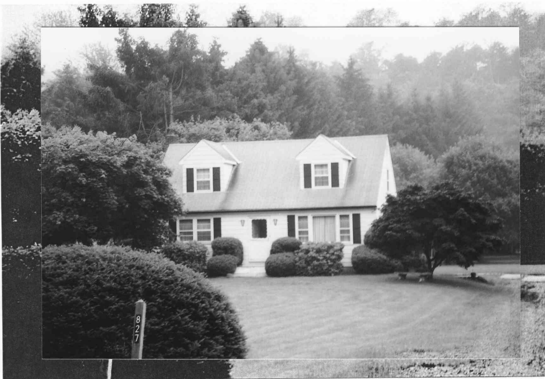
Photograph 10: 827 S.R. 0287. Dwelling, view of the east elevation looking west.

Photograph Sheet 5, Photographs taken in June 2003