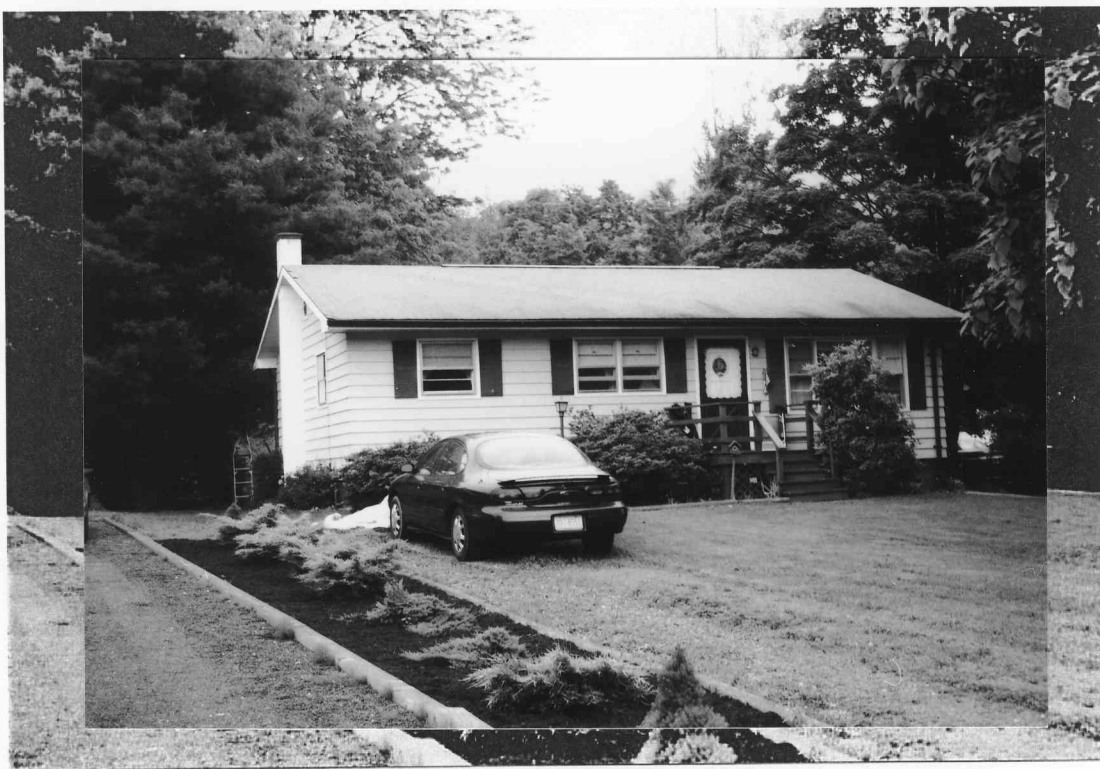
Photograph 5: 737 S.R. 0287. Dwelling, view of the east elevation looking west.