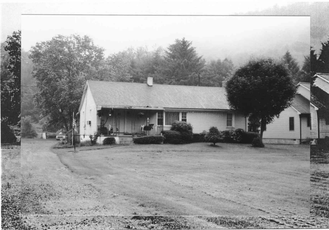
Photograph 8: 787 S.R. 0287. Dwelling, view of the east elevation looking west.

Photograph Sheet 4, Photographs taken in June 2003