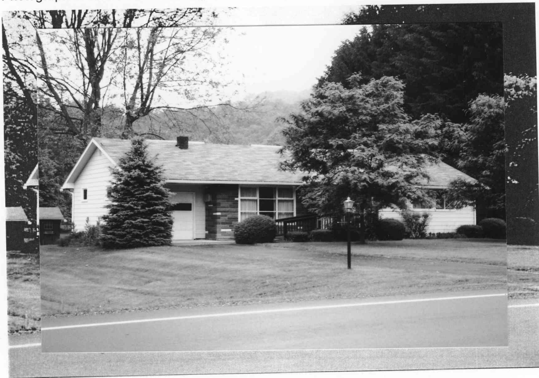
Photograph 3: 701 S.R. 0287. Dwelling, view of the east elevation looking west.