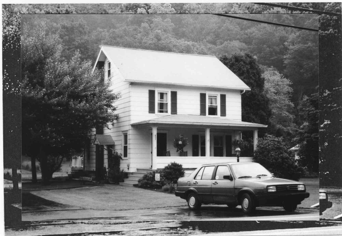
Photograph 11: 923 S.R. 0287. Dwelling, view of the southeast corner looking northwest.