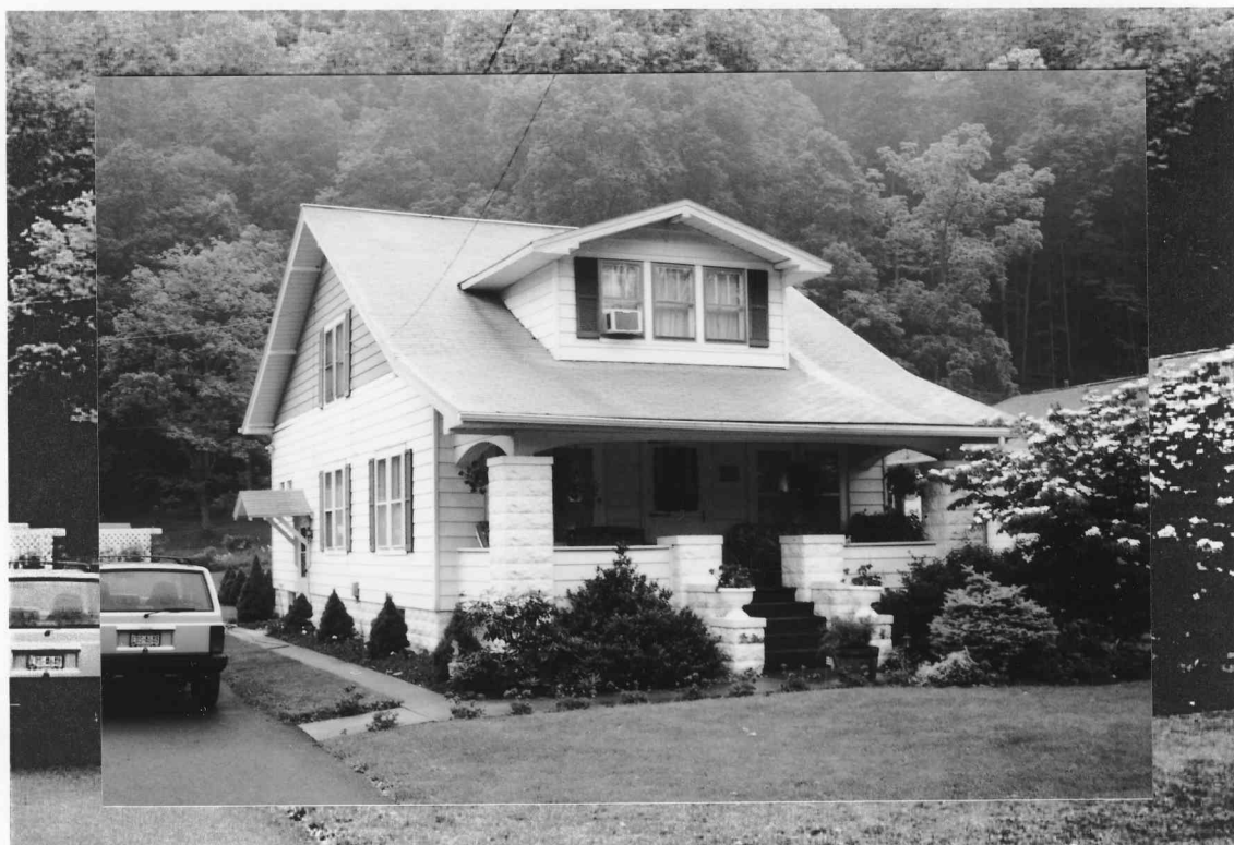
Photograph 13: 949 S.R. 0287. Dwelling, view of the southeast corner looking northwest.