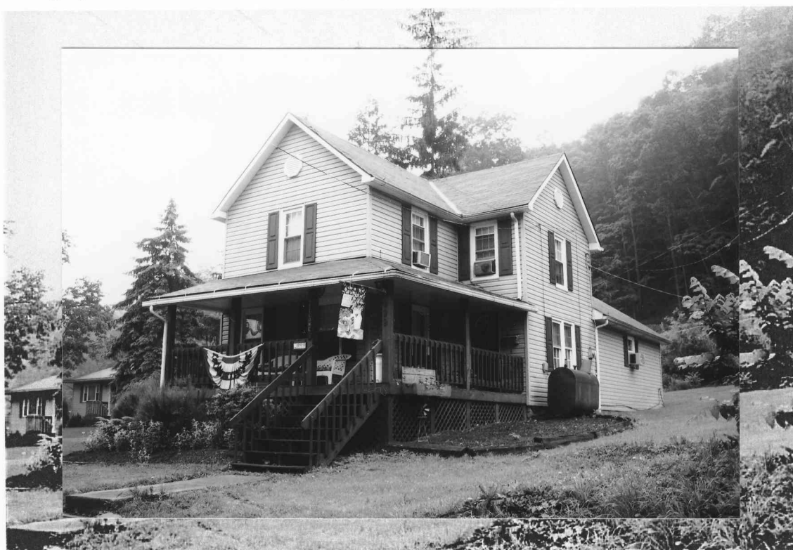
Photograph 15: 999 S.R. 0287. Dwelling, view of the northeast corner looking southwest.