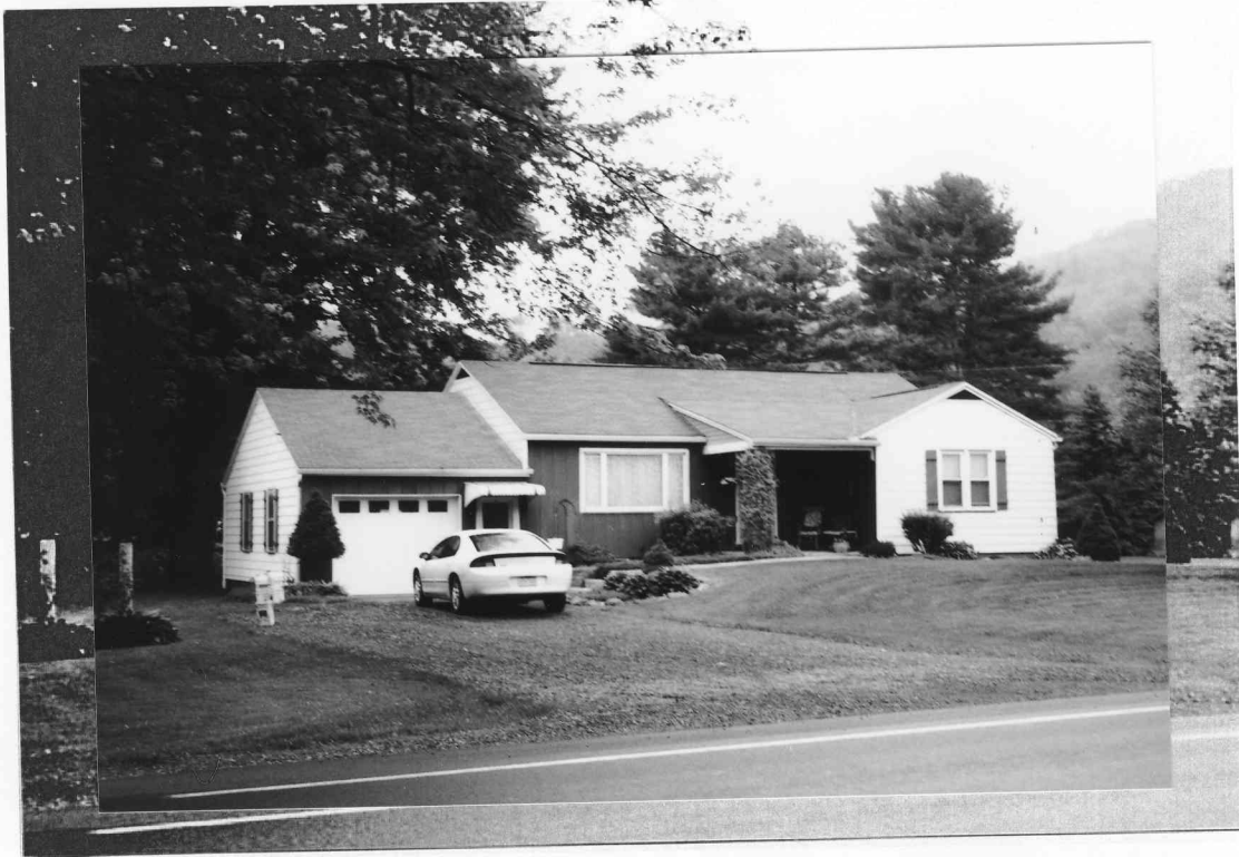
Photograph 2: S.R. 0287. Dwelling, view of the east elevation looking west.

Photograph Sheet 1, Photographs taken in June 2003