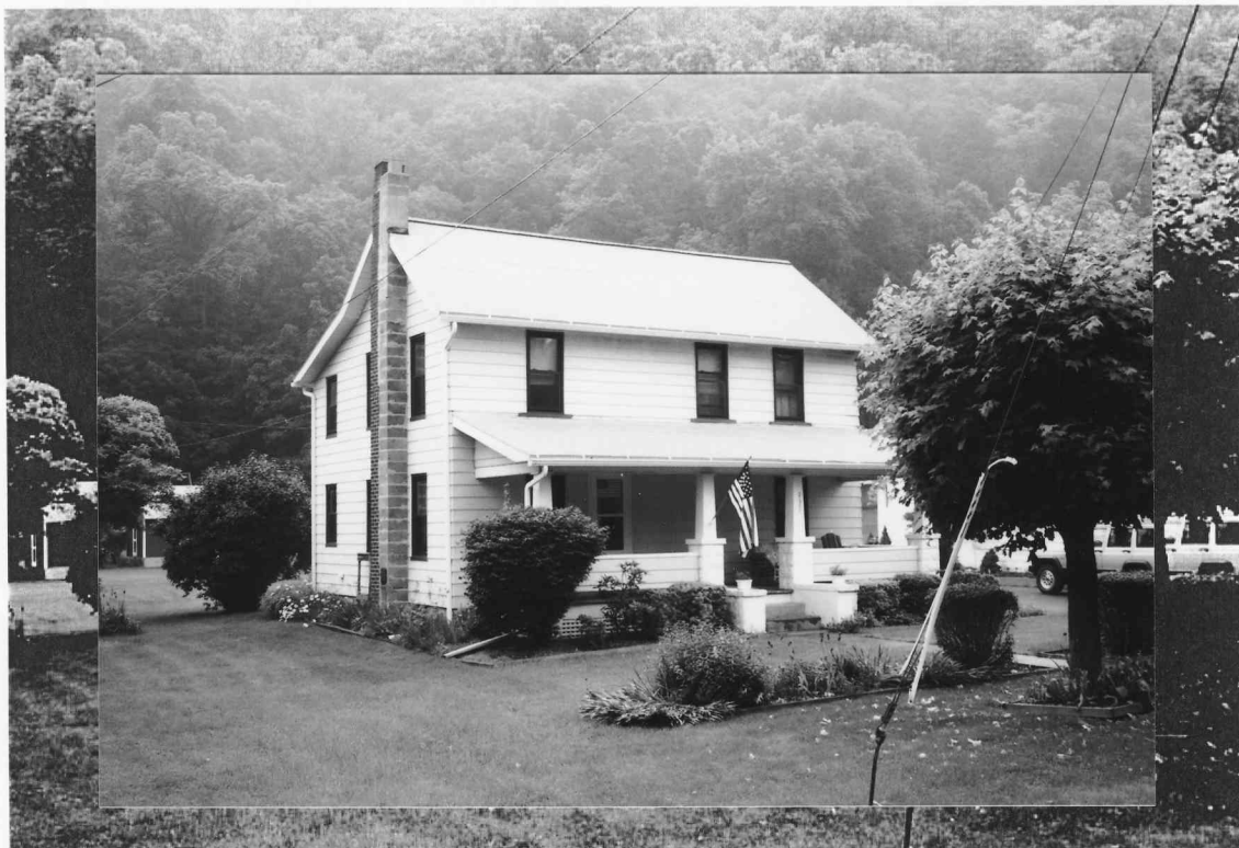
Photograph 12: 937 S.R. 0287. Dwelling, view of the southeast corner looking northwest.

Photograph Sheet 6, Photographs taken in June 2003