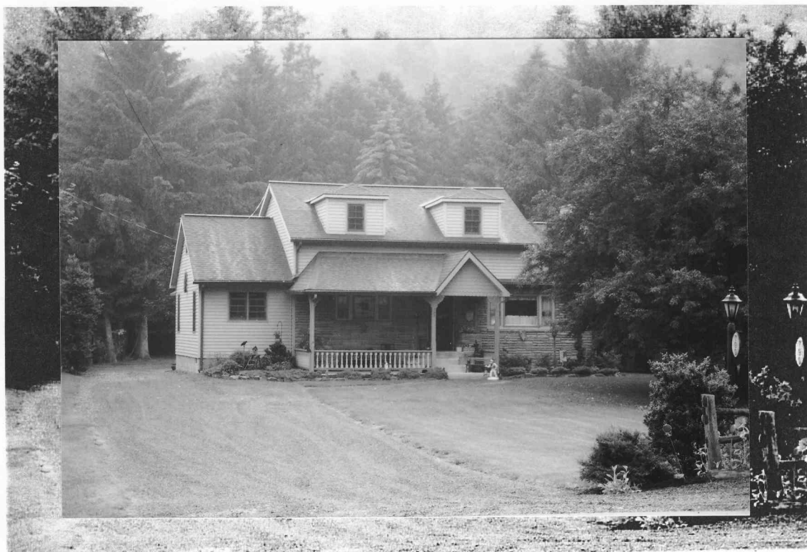
Photograph 9: 799 S.R. 0287. Dwelling, view of the east elevation, looking west.