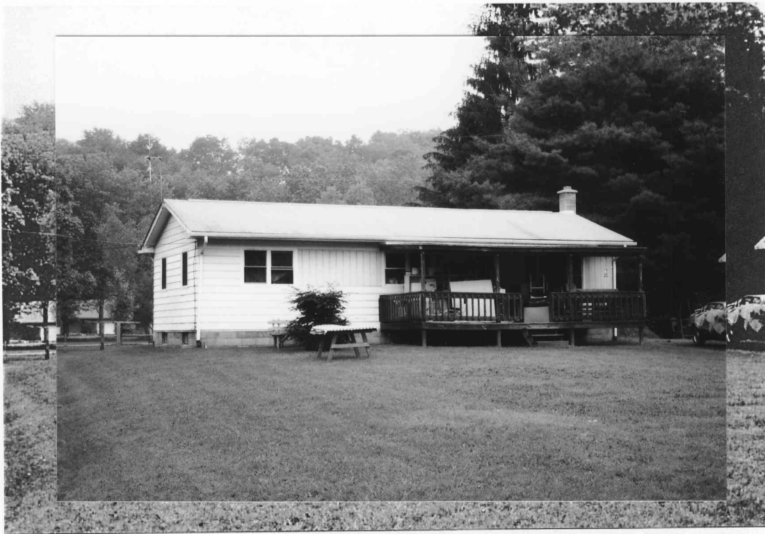
Photograph 4: 735 S.R. 0287. Dwelling, view of the east elevation looking west.

Photograph Sheet 2, Photographs taken in June 2003