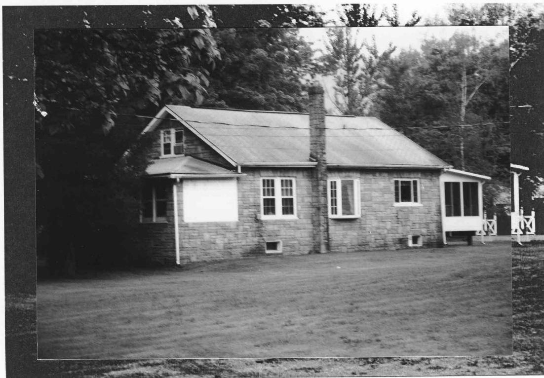
Photograph 6: 759 S.R. 0287. Dwelling, view of the northeast corner, looking southwest.

Photograph Sheet 3, Photographs taken in June 2003