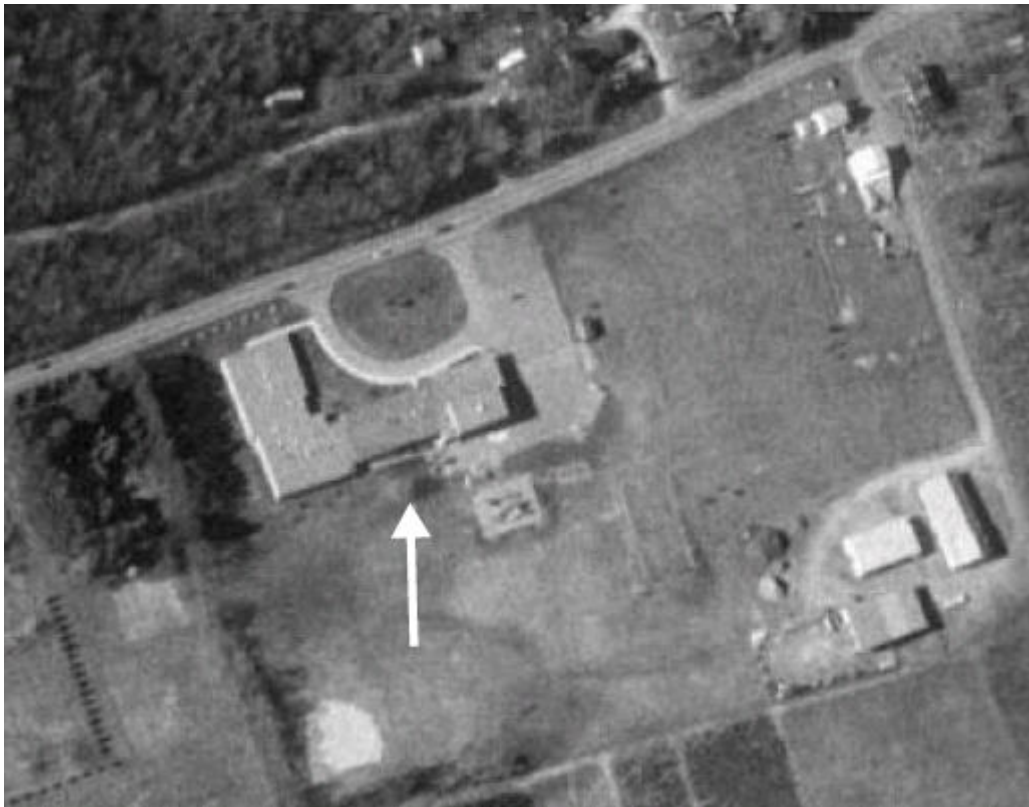
Aerial View of Towamensing Elementary School

1999 Palmerton, PA Quadrangle . Topography compiled 1951. Planimetry derived from imagery taken 1982 and other sources. Photoinspected using imagery dated 1997. Survey control current as of 1960. Boundaries, other than corporate, revised 1999. Denver, CO.