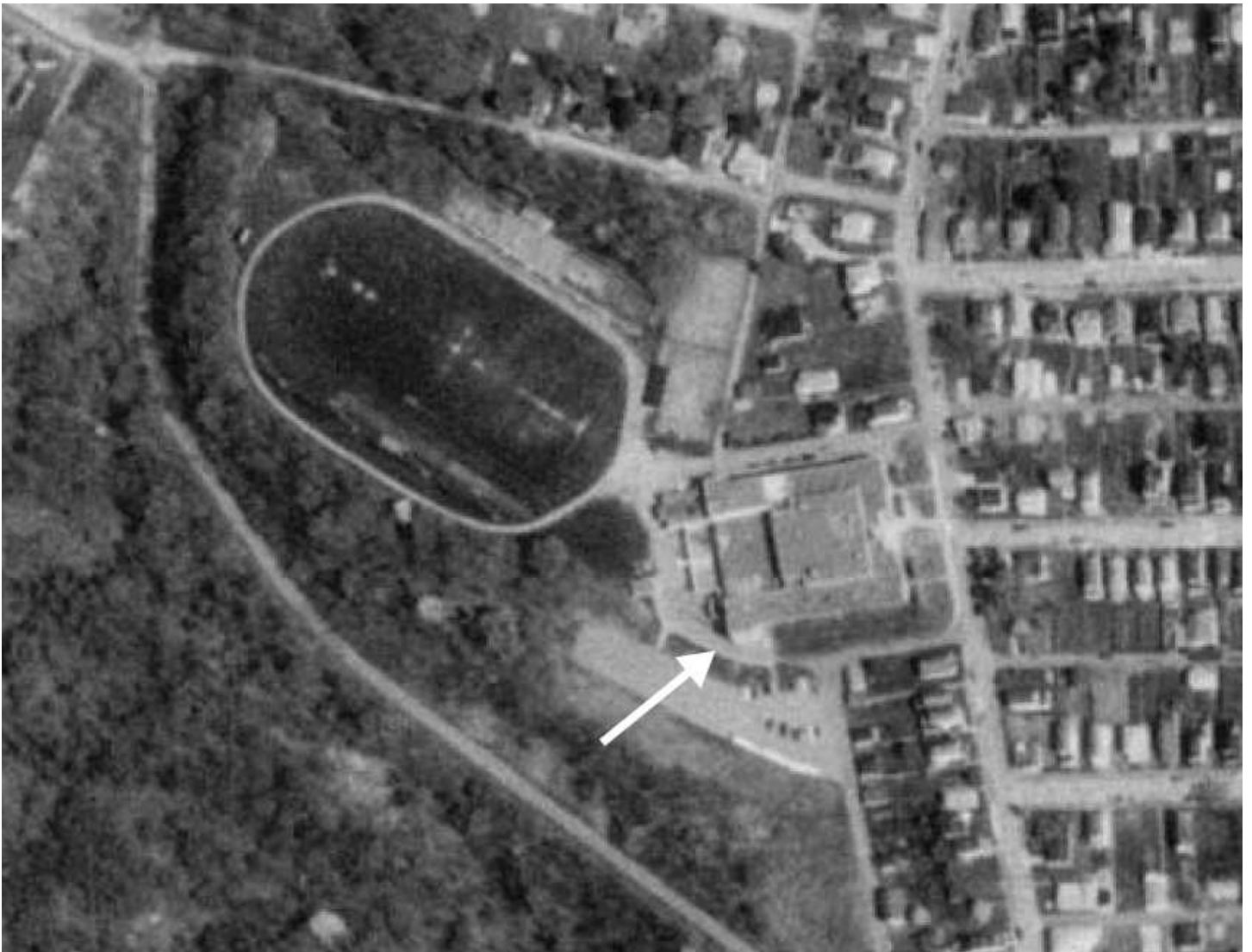
Aerial View of Donora Elementary