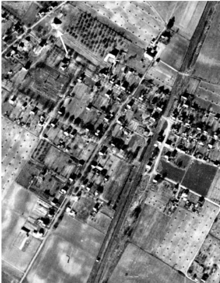
Aerial View of Marion Elementary

1937 Aerial Photograph AHF 30-38. On file at the Pennsylvania State Archives, Record Group 31, Records of the Department of Commerce, State Planning Board Collection.